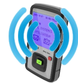
Software option for POCSAG transmission