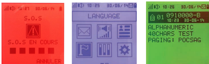
Friendly user interface - Display with color backlight