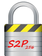
Software option for encryption Secure Paging Protocol with AES256