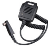
Noise Canceling Remote Speaker Mic SM13N4