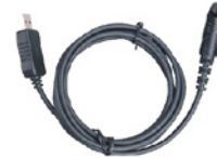
Programming Cable (USB Port) PC25